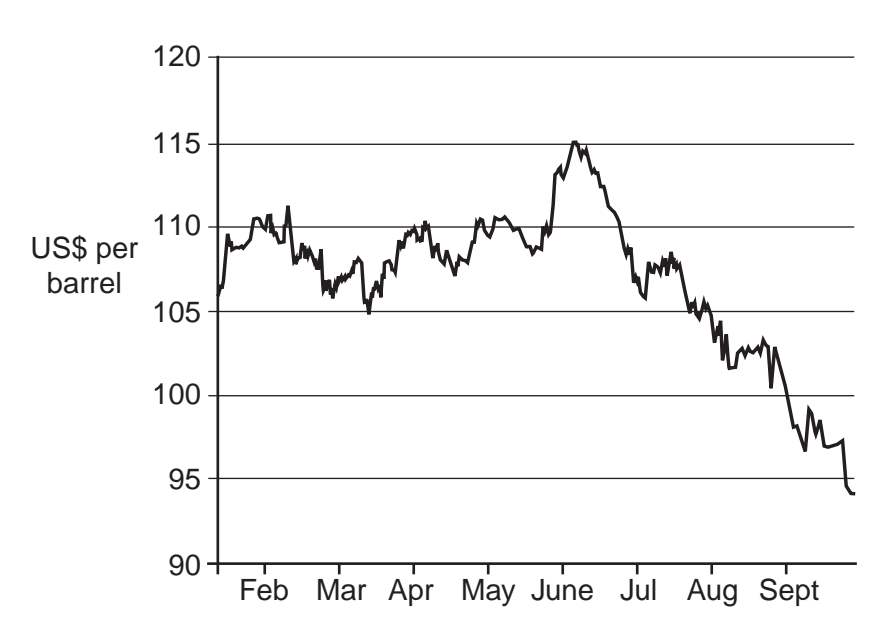
Fig. 1: Crude Oil Prices, 2014